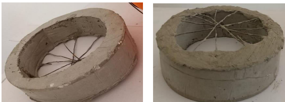
Fig No 7.0 Mini Binishell Foundation Model