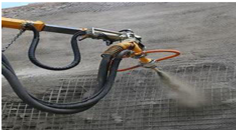
Fig No 3.0 Shotcreting

Next up, we spray concrete onto the inflated membrane. But this isn't just your average concrete mix specially made to be super strong. As we spray the concrete starts to pile up, forming a thick layer over the membrane and taking on its shape. We've got to give the concrete some time to set and harden. This is called curing, and it's where the magic really happens. Just like waiting for cake batter to turn into a yummy cake in the oven we've got to be patient while the concrete becomes solid and sturdy. Once the concrete is good and solid it's time to get rid of the membrane. This is where things get really cool. We deflate the inflated membrane and take it away leaving behind the concrete shell. And because the concrete has hardened it holds its shape all on its own no need for the membrane anymore.