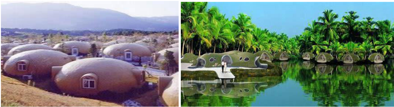
Fig No 5.0 Mud Binishell, Floating Binishell

Binishells in sustainable architecture and advanced materials enhancing structural integrity and sustainability paving the way for more resilient and eco friendly structures. Integration with digital technologies like 3D printing and robotics promises faster, innovative designs and cost effective building.