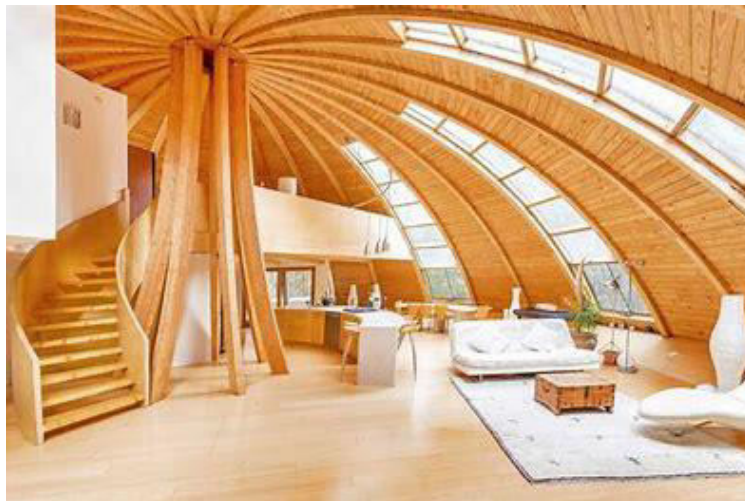
Fig No 4.0 Furnish Binishell

Binishell construction offers numerous advantages over conventional methods. It's notably cost effective due to reduced labor, materials, and time requirements leading to significant cost savings. Its speed of construction is more than traditional methods by the inflatable formwork which allows for rapid assembly and shaping of structures. Binishell structures boost energy efficiency due to their efficient shape and construction materials requiring less energy for heating and cooling. This is enhanced by their natural insulation of the dome shape reducing reliance on artificial heating and cooling systems. From an environmental stand point Binishell construction shines. It generates less waste and uses fewer materials during construction contributing to sustainability. It can incorporate sustainable materials and technologies to minimize environmental impact. The Binishell structures is another advantage as they can various purposes and architectural styles offering customization to meet specific design requirements. Binishell structures have proven facing natural disasters like earthquakes and hurricanes owing to their evenly distributed force absorption capabilities. Binishell structures stand out with their unique visually striking appearance characterized by smooth curved lines setting them apart from traditional structures.