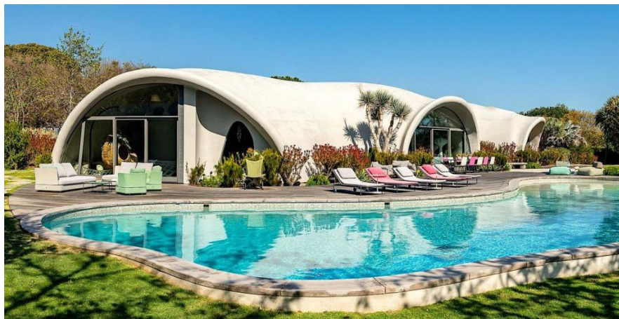
Fig No 1.0 Binishell,Nicolo Bini,2009,Los Angeles

Binishell construction is like a beacon of human creativity and innovation in the world of sustainable architecture. Imagine this back in the 1960s architect Dr. Dante Bini had this wild idea that shook up the way we build things. He came up with the Binishell method, a total game-changer in construction that flips traditional techniques on their head. Binishell construction uses air-supported membranes to shape concrete into strong shell structures. It's kind of like blowing up a balloon, spraying concrete on it and letting it harden into a solid shell. Once the concrete sets you deflate the balloon like membrane and voila You are left with a sturdy building with that signature curved shape.