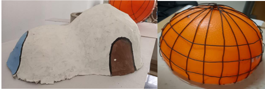
Fig No 6.0 Mini Binishell Model