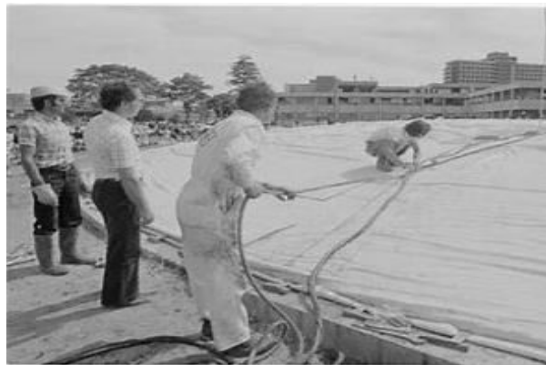
Fig No 2.0 Fabric Or Polymer Flexible Membrane

Think of blowing up a balloon. That's how Binishells kick off. We start with a big, flexible membrane made of tough fabric or polymer. Then we pump it full of air to create a kind of temporary mold that's shaped like the building we want.